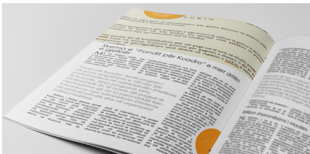
Image 1. News published in the GAP Monitor, May 2009, following the Government Decision on the Approval of the Cadre Fund

Therefore, through this Fund, which later was designated as the "Cadre Fund," several new positions would be created for senior-level specialists who would be paid from EUR 800 to EUR 1,800 per month, depending on the position. 10 Initially, eight new positions were created with a corresponding budget allocation of EUR 41,375 and over the years, the number of positions and the budget increased steadily, where by 2014, there were 222 people benefiting under the Fund and the available budget had reached EUR one million. 11